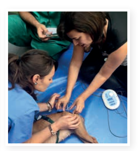
Intensive hands on training during the presence days.